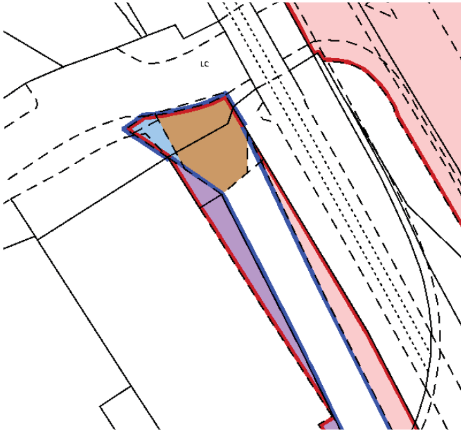
Title Plan extract – BL153134